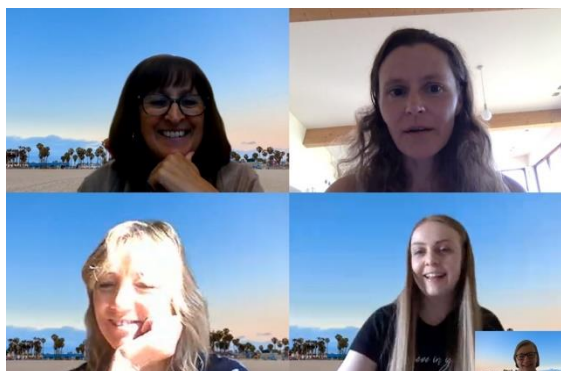
A few of us in an online staff meeting...