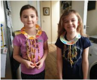
Maasai necklace designs