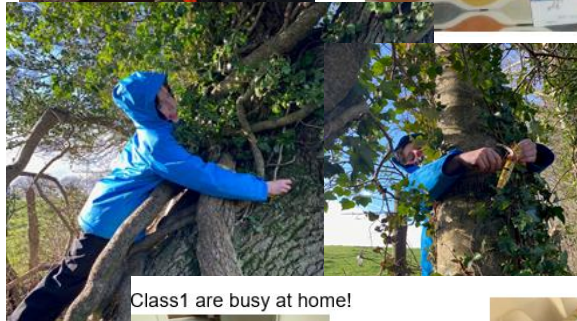
Enjoying the great outdoors and a maths assignment!