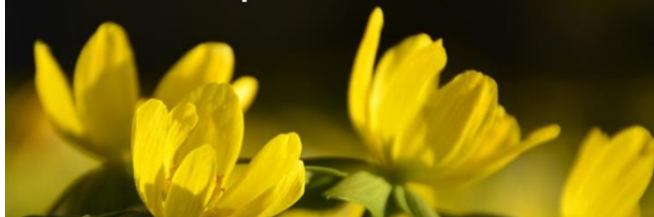
Class1 are busy at home!

Be kind and compassionate to one another, forgiving each other, just as in Christ God forgave you. Ephesians 4:32