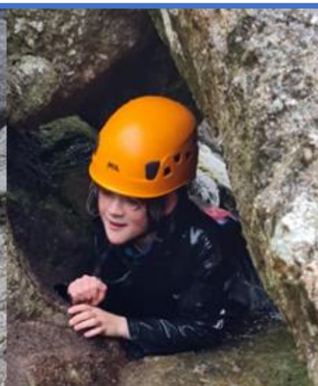
A wild and windy two days for class 4 on their Dartmoor adventure days