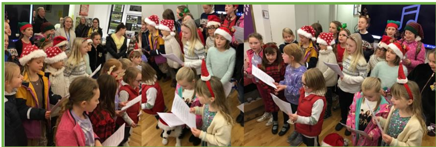
Song machine performing at the Christmas fair.